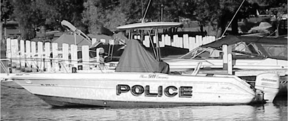
Geneva Lake Law Enforcement Agency 245-9824