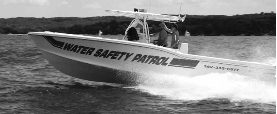
245-6577 Geneva Lake Water Safety Patrol