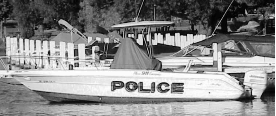
Geneva Lake Law Enforcement Agency 245-9824