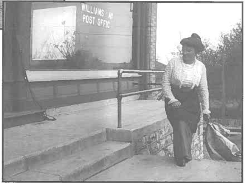
Vintage photo loaned to Yerkes Observatory from the archives of the Williams Bay UCC Church. This photo taken by Yerkes photographer Blakesly in 1914 to document a “Day in the life of Williams Bay.”