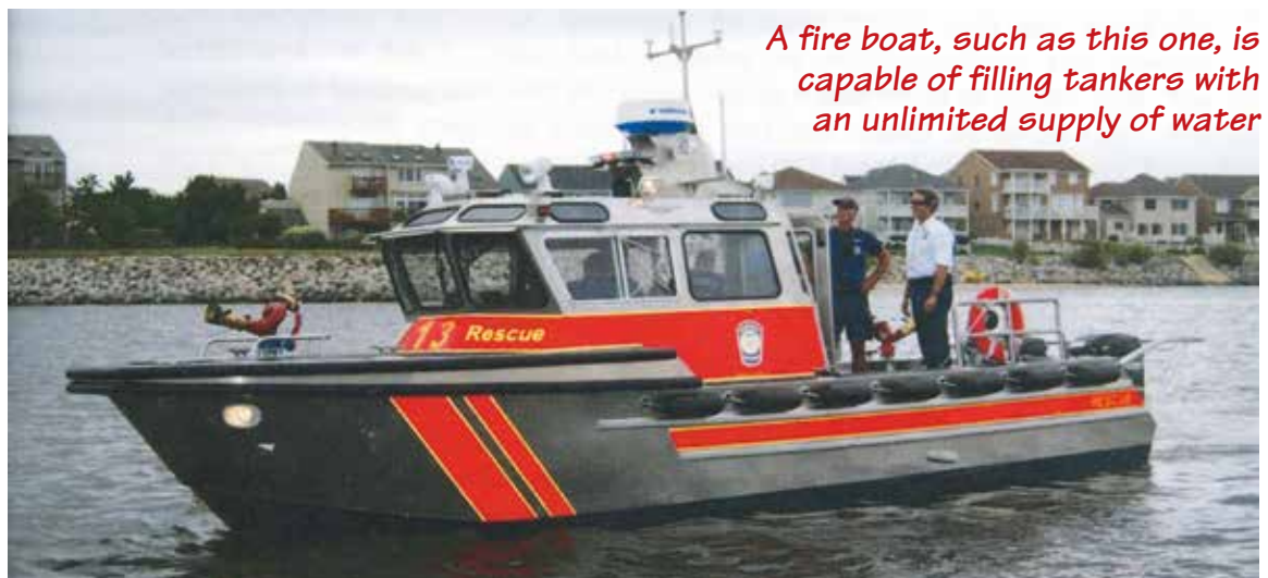
A fire boat, such as this one, is capable of filling tankers with an unlimited supply of water