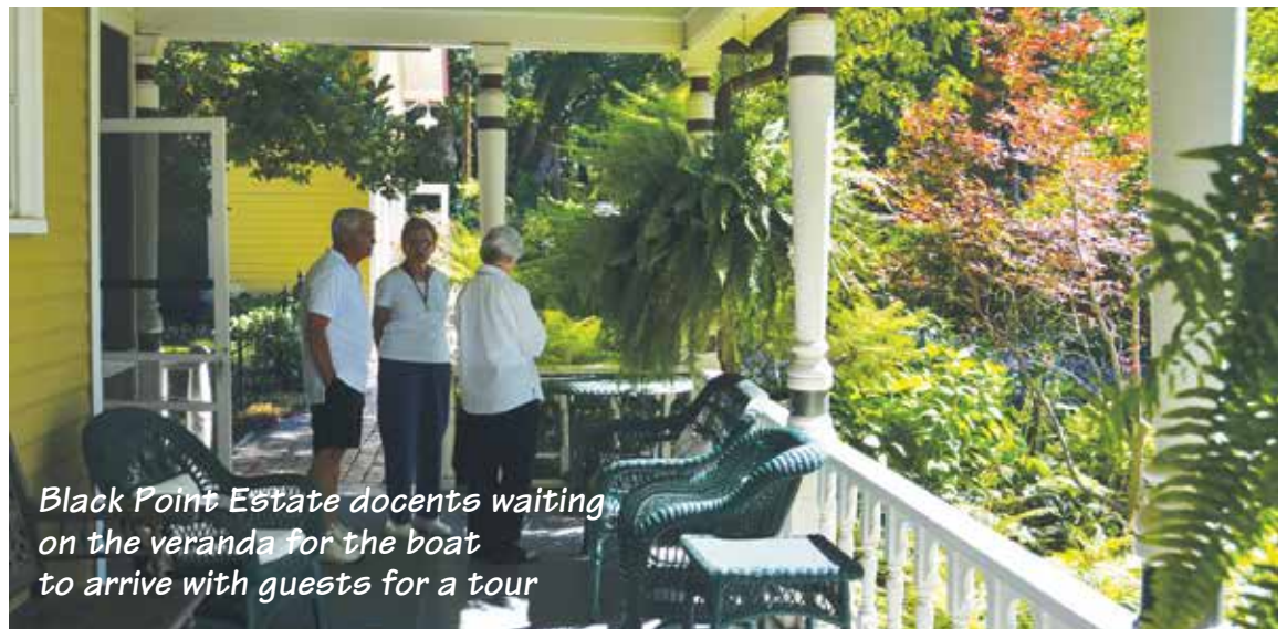
Black Point Estate docents waiting on the veranda for the boat to arrive with guests for a tour

Tours continue throughout the summer months. If you haven't already, be sure to visit this historical and beautiful Geneva Lake gem. Information about the estate and tours can be found at http://blackpointestate.wisconsinhistory.org .