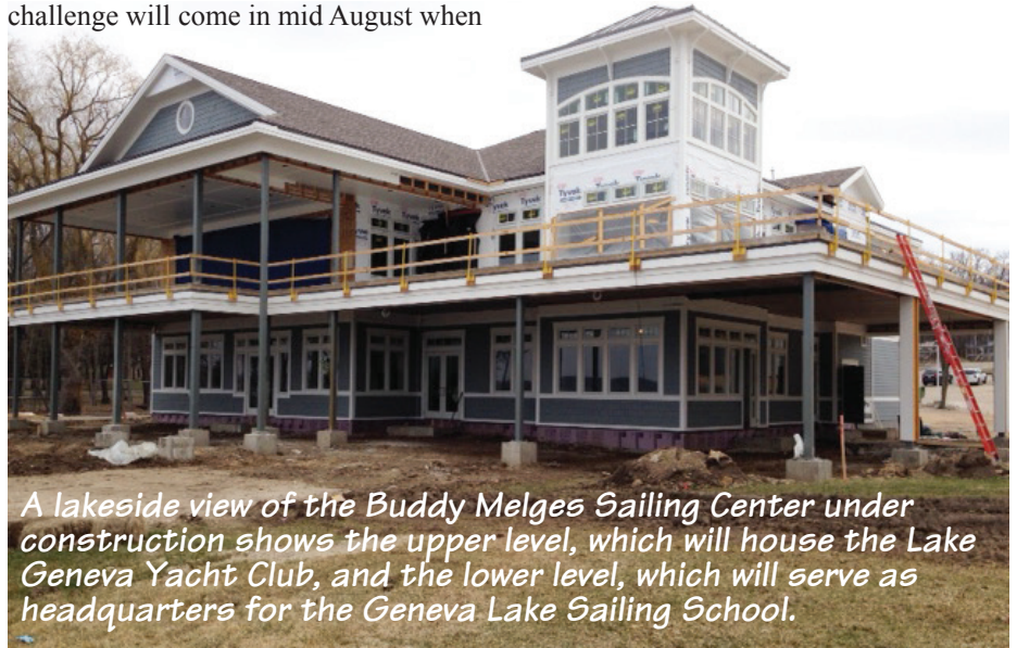
A lakeside view of the Buddy Melges Sailing Center under construction shows the upper level, which will house the Lake Geneva Yacht Club, and the lower level, which will serve as headquarters for the Geneva Lake Sailing School.

it hosts the 2015 Inland Lake Yachting Association Annual Championship Regatta. The ILYA is 118 years old, tracing its roots in competitive scow sailboat racing back to 1897. Five fleets of scows will be skippered and crewed by locally, nationally, and internationally recognized sailors, many of whom call Geneva Lake their home.